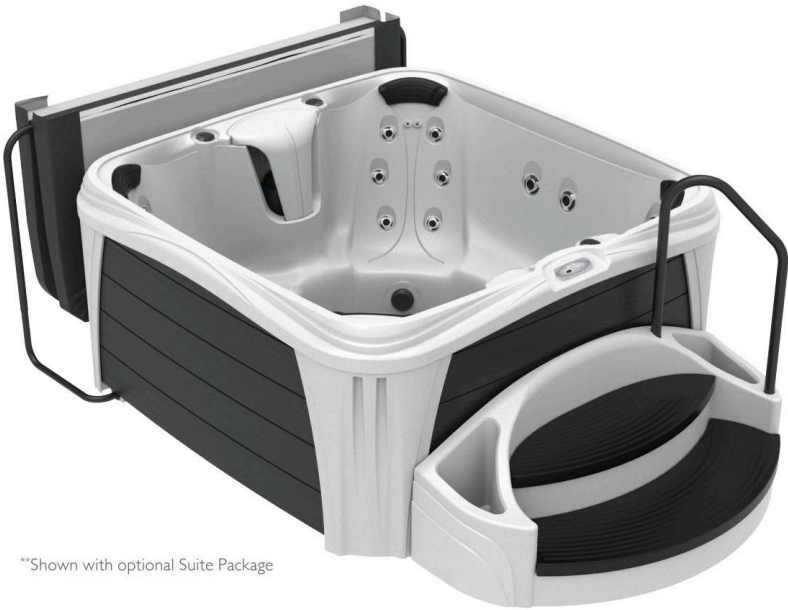
**Shown with optional Suite Package